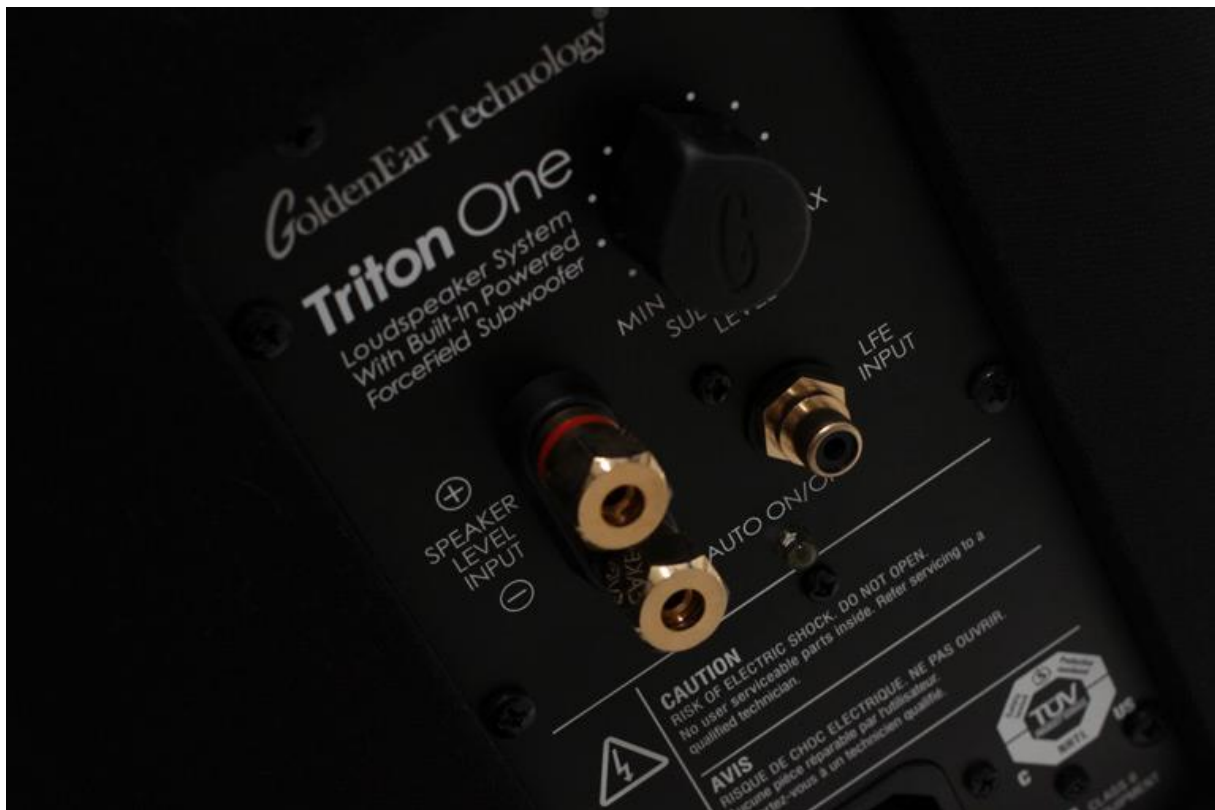
GoldenEar Technology Triton One

Toward the bottom of the Triton One's rear panel is a plate containing: an IEC-compatible power-cord inlet, to power the woofer section; an LFE input jack (RCA), should you wish to drive the woofers from the LFE output of a preamplifier or receiver (I didn't); the speaker-cable connectors; and the Subwoofer Level control, which ranges from Min to Max and is vital to achieve the best bass balance in your room. My only complaint about this rear plate is a small one: a blue LED lights up to indicate when the woofers are operating (they turn on when they sense an incoming signal, and off if there's no signal for a time). On the one hand, it's handy -- you can tell when the woofers are powered on, and the blue light makes a pleasant glow behind the speaker. On the other, the LEDs were bright enough that, in my room, each speaker splashed a noticeable amount of light on my projection screen. I had to put tape over both LEDs.