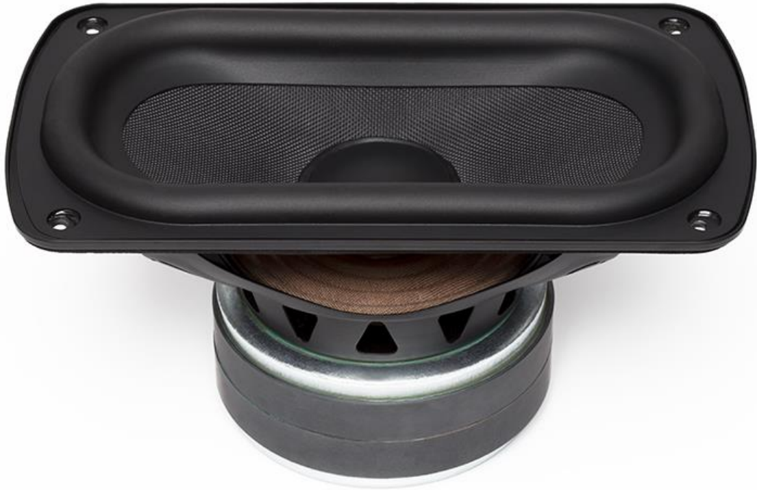
GoldenEar Triton One woofer

The Triton One has three 5" x 9", racetrack-shaped bass drivers, whereas the Triton Three has only one (the Two has, well, two) -- which might have some wondering if GoldenEar shouldn't have switched the models' names. The One's three drivers are controlled by a 56-bit DSP engine operating at 192kHz (vs. 48/96 for the Two and Three) to maximize bass extension and improve linearity, and are driven by a built-in 1600W amplifier (vs. 1200W for the Two and 800W for the Three). Assisting these woofers' outputs are four 7" x 10" passive radiators (two per side in a balanced configuration, as opposed to one per side in the Two and Three). These three woofers and four passive radiators comprise a great amount of radiating area, with the express goal of delivering more and deeper bass than has any other GoldenEar speaker. As a result, the company specifies for the One a low-end extension of 14Hz, vs. 16Hz for the Two and 21Hz for the Three. Those specs might seem overly optimistic -- they exceed the bass range of many subwoofers. However, as you'll read below, the One's bass output was nothing short of remarkable, eclipsing that of far costlier models from other brands. The One got way down there.