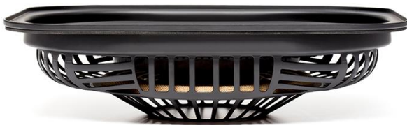
GoldenEar Triton One passive radiator

The Triton One has three 5" x 9", racetrack-shaped bass drivers, whereas the Triton Three has only one (the Two has, well, two) -- which might have some wondering if GoldenEar shouldn't have switched the models' names. The One's three drivers are controlled by a 56-bit DSP engine operating at 192kHz (vs. 48/96 for the Two and Three) to maximize bass extension and improve linearity, and are driven by a built-in 1600W amplifier (vs. 1200W for the Two and 800W for the Three). Assisting these woofers' outputs are four 7" x 10" passive radiators (two per side in a balanced configuration, as opposed to one per side in the Two and Three). These three woofers and four passive radiators comprise a great amount of radiating area, with the express goal of delivering more and deeper bass than has any other GoldenEar speaker. As a result, the company specifies for the One a low-end extension of 14Hz, vs. 16Hz for the Two and 21Hz for the Three. Those specs might seem overly optimistic -- they exceed the bass range of many subwoofers. However, as you'll read below, the One's bass output was nothing short of remarkable, eclipsing that of far costlier models from other brands. The One got way down there.