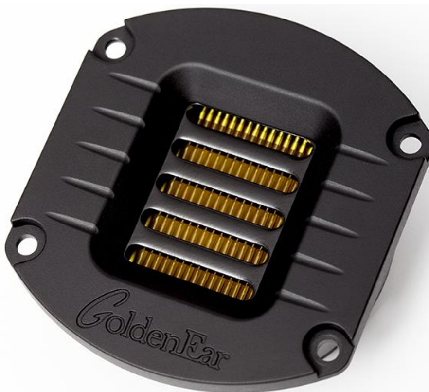
GoldenEar Technology tweeter

In an effort to tone down the spaciousness the Triton Ones provided and get an even better handle on their sound above the bass range, I turned to Glenn Gould's A State of Wonder , which includes both his 1955 mono and 1981 stereo recordings of J.S. Bach's Goldberg Variations (16/44.1 FLAC, Columbia/Legacy). Listening to the mono version, and given the center fill I'd heard with my stereo recordings, I wasn't surprised to hear Gould's piano emanate from an appropriately tight space between the speakers and with absolutely no smear to either side, just as it should. What struck me, though, were the outstanding transparency, detail (tape hiss, recording flaws, Gould's humming and muttering), and transient attacks -- the weighty Ones now sounded fast, clean, and alive. I also liked the highs, which were lively and incisive but never edgy or bright. The One may be a big, bold, full-range speaker that can produce the low end with aplomb, but it could also sound delicate, exquisite, and utterly refined throughout the rest of the audioband.