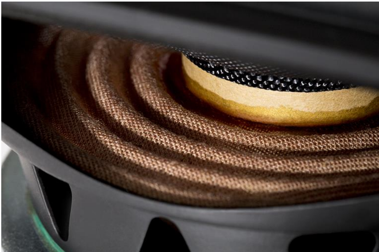
GoldenEar Triton One woofer spider

I first set up the Triton Ones with their bass dials at 1 o'clock, the level at which we'd measured the One in the NRC's anechoic chamber. Then I sat down to listen to the title track of Sade's Soldier of Love (16-bit/44.1kHz FLAC, Columbia), with the preamp volume set at the level I have it for most speakers. But about 12 seconds in, when the song picks up, I made a dash from listening chair to preamp to quickly ratchet down the level. The Ones were playing much louder than most speakers I've had in my room, which meant that their specs didn't lie: The One is a very sensitive design. And the bass so overpowered my very large room that the walls shook more forcefully than with any other speaker I've had here. This indicated to me that the One's slender cabinet is indeed capable of delivering some crazy-deep low-frequency output. But it was just too much.