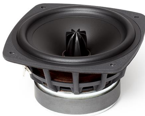
GoldenEar Triton One midrange

The M1 was much wider than it was deep, but the Triton One is the opposite: its tapered cabinet is only 5.75"W in front, 8"W in back, and 17"D. The result is a fairly large speaker that isn't that intrusive in a room. Furthermore, the One's shallow base -- 12 3/8"W at its widest by 19 3/4"D -- adds little bulk to the design. Instead, it mostly adds stability -- particularly with the spikes screwed in, without which this tall, narrow speaker would fall over. The One's rounded front, which also helps it look smaller, has a curved mesh made mostly of metal, with plastic at the ends, attached to the front baffle and concealed by the sock.