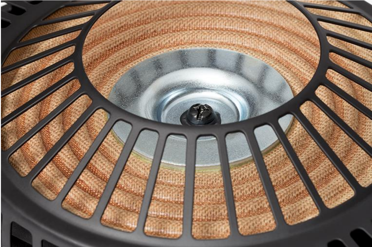
GoldenEar Triton One passive radiator

Yet even with that reduction in bass, the One still sounded fuller and deeper than had any floorstanding speaker I've listened to or reviewed here lately, including such higher-priced offerings as the Sonus Faber Olympica III ($13,500/pair), Magico S5 ($29,600/pair), and Polymer Audio Research MKS ($42,000/pair) -- all fully passive designs. The Triton One also reached considerably deeper in the bass than the Definitive Technology Mythos ST-L SuperTower, which costs only 8¢ less per pair and has a powered bass section replete with passive radiators, but fewer drivers overall -- a single 6"x10" woofer and two 6"x10" passive radiators -- and a significantly smaller, slimmer cabinet. That's not to knock the ST-L -- its bass is surprisingly deep for its cabinet's size. It's just that the larger One went much lower.