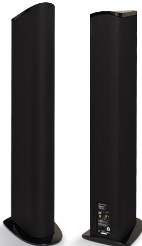
GoldenEar Technology Triton Ones

I vividly recall how impressed I was when, in 1987, I first saw a pair of Mirage M1 loudspeakers -- and how bowled over I was when I heard them. It's as if it happened yesterday. The M1's tall, wide, shallow, all-black cabinet made it look like the Monolith from 2001: A Space Odyssey, and its front- and rear-mounted drivers -- a technology then dubbed bipolar -- produced an enormous soundfield quite unlike anything I'd heard. While its price of $6000 USD per pair was not cheap in 1987, it was still reasonable enough that a serious audiophile with a half-decent job could afford it (though that year, I bought a car instead). The M1 was an awesome but still attainable audiophile masterpiece -- a classic of 1980s loudspeaker design. I guess it's odd to open a review of GoldenEar Technology's current flagship model, the Triton One (€ 5900,- /pair), by praising a 28-year-old loudspeaker from another company. Or maybe not . . .