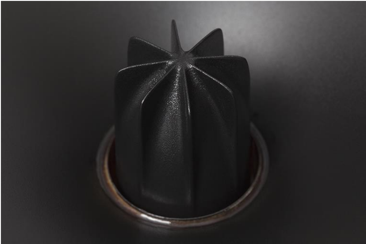
GoldenEar Triton One midrange

real with much of my music, and no better example of this was provided than by the 24/192 version of Jackson Browne's Running On Empty (24/192 FLAC; Elektra, now available only in 24/96), reportedly culled from the 2005 DVD-Audio release of this album (discontinued), which also contained a 24/96, 5.1-channel mix. The 24/192 release sounds quite a bit different from my 2001 CD edition, and to my ears more authentic -- its greater richness and fullness were particularly noticeable through the Ones. The title track was reproduced with awesome senses of power, space, and realism -- it sounded like a real rock band playing on a real stage. The drums, in particular, had a weight and slam that were uncanny, not only for a pair of speakers at this price, but for speakers costing multiples of the price -- the ST-L, S5, MKS, and Olympica III all sound stunted by comparison. Yet all that bass weight didn't obscure the natural sounds of Jackson's voice, his guitar, or the piano to his right.