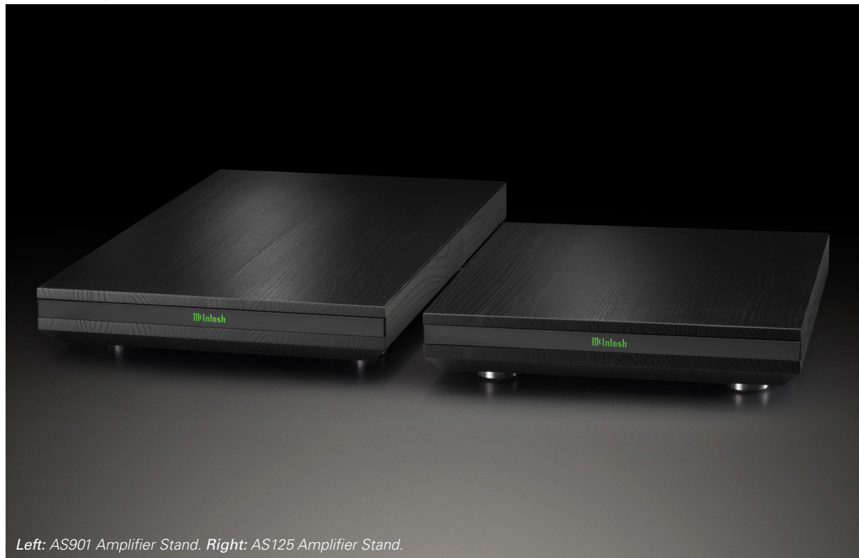
Left: AS901 Amplifier Stand. Right: AS125 Amplifier Stand.