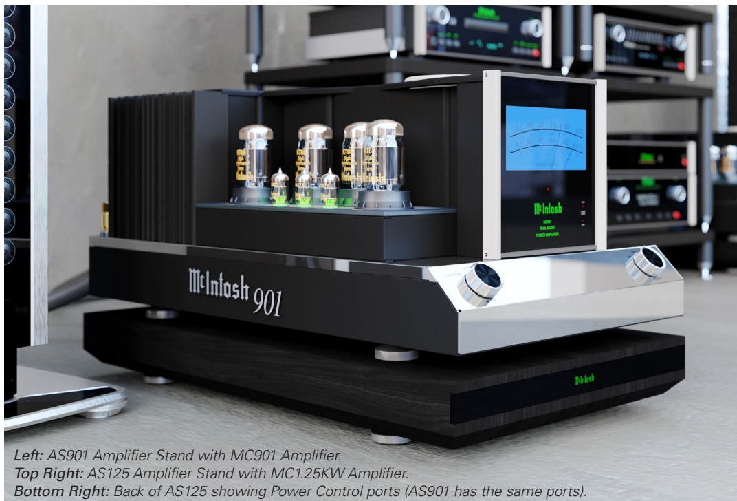
Left: AS901 Amplifier Stand with MC901 Amplifier.