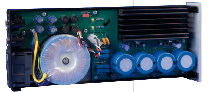
For a phono preamp, the power supply is rather potent and impressive with plenty of filter caps and chokes.

This is how the studio pro does it: two gain stages, class A output stage and a very clean layout