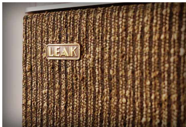
From the beginnings, to the modern day, LEAK's instantly recognisable styling and performance remain corner stones of the brand's appeal. Returning for the audio enthusiast of the 21st century, the pillars of the LEAK brand remain, and are stronger than ever!

Please visit the website for more details and historical events: https://www.leak-hifi.co.uk/