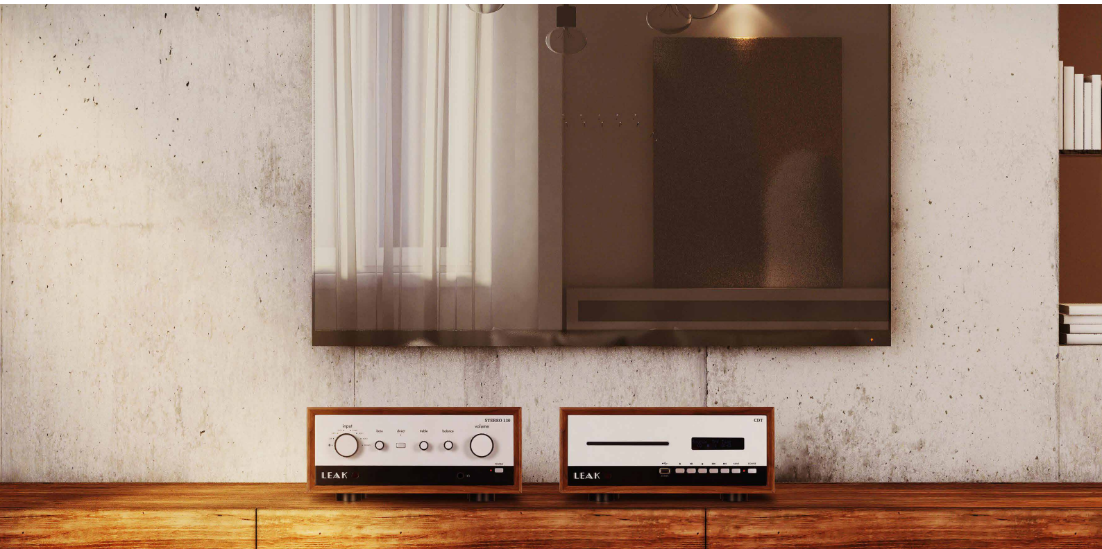
Above: LEAK CDT, CD transport (with wood chassis) paired with LEAK STEREO 130, integrated amplifier