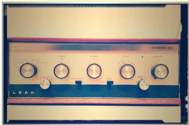
The original LEAK STEREO 30 was the first transistor amplifier from LEAK. A raging success, it sold over 50,000 units during its 5 years in production.