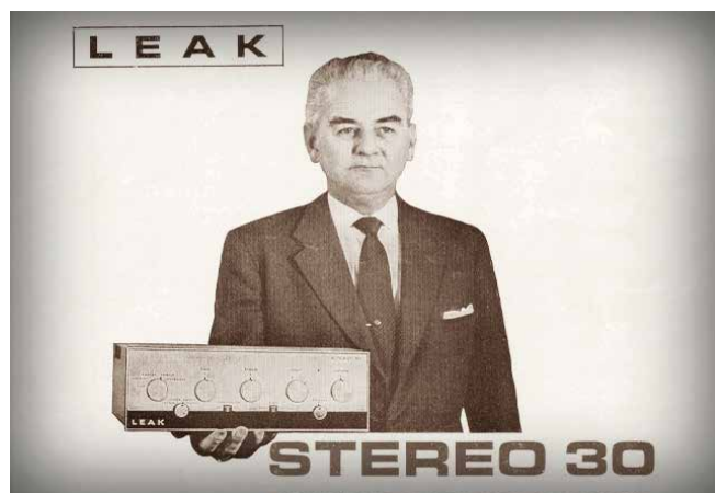
LEAK developed amplifier technology, loudspeakers, pickups and turntables, amongst many seminal products in a portfolio spanning through the golden years of British audio innovation. LEAK became a market leader of affordable but high-performance home audio equipment... for decades upon decades.