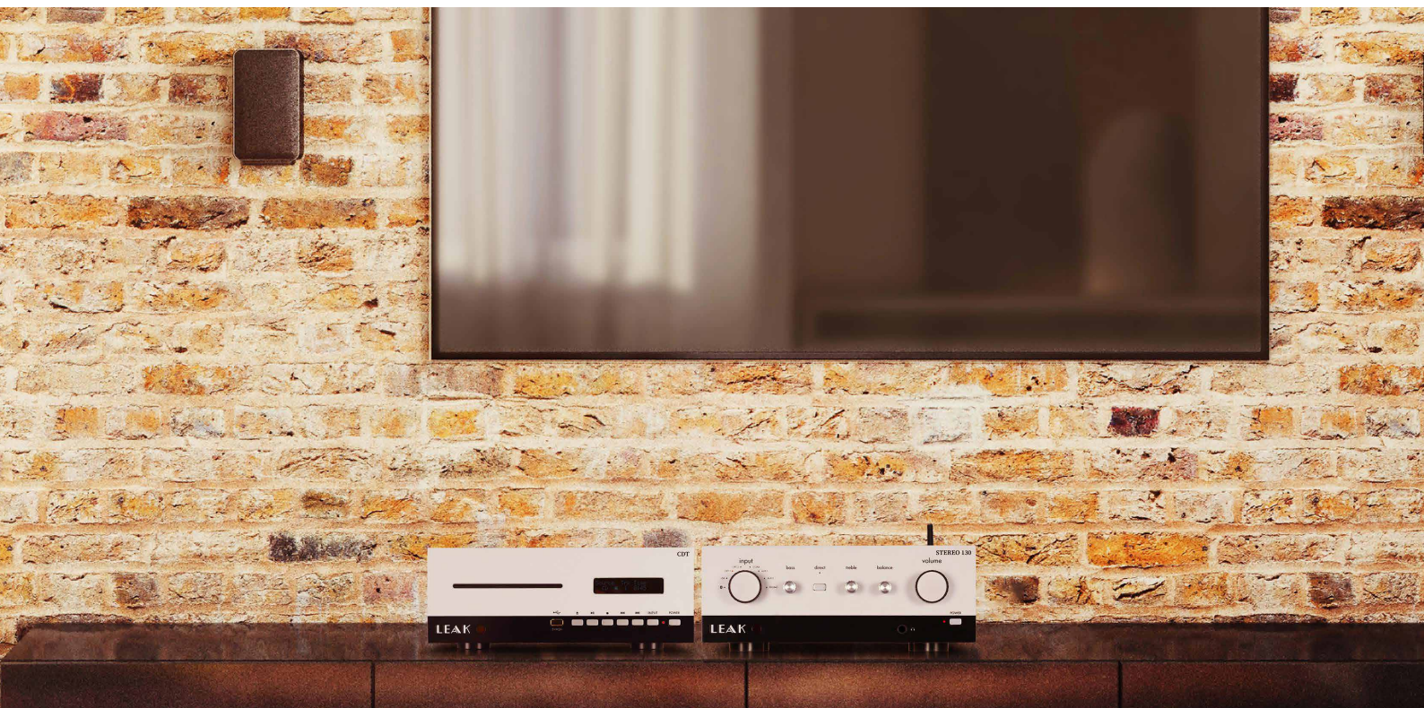
Above: LEAK CDT, CD transport (without wood chassis) paired with LEAK STEREO 130, integrated amplifier